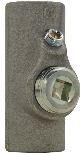
Vertical or horizontal female